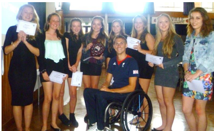
Girls Team of the Year: U15 Netball