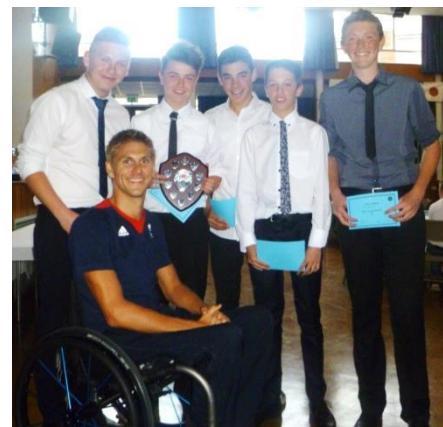
Boys Team of the Year: U15 Cricket