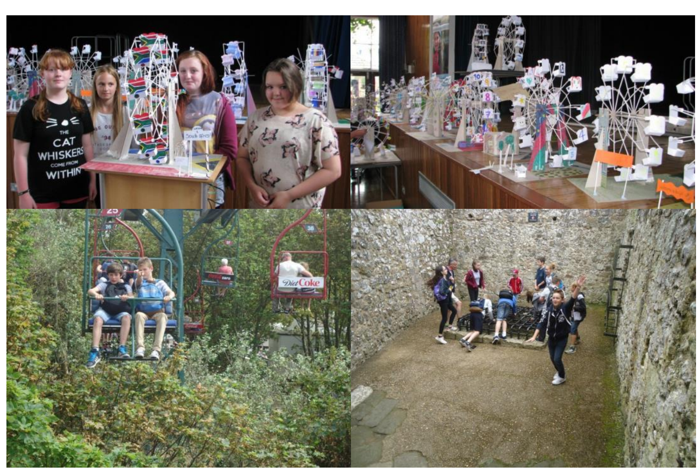
Year 7 Year 7 students made the 'Ferris wheel of fun', enjoyed tag rugby, visited the Isle of Wight and were entertained by a band.

And that's the end of one of the most successful activities weeks Sackville has seen!