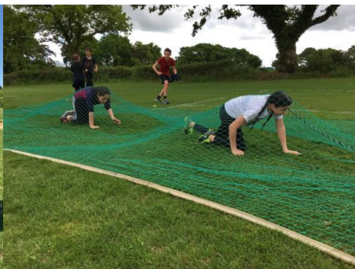
Our year 7 rounders A and B teams, and the year 7s at play in the 'Tough Mudder' event at St Bede's