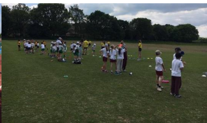
Sports leaders helping at primary tennis and tri-golf events

Please can you send in any old footballs you might have taking up space in a shed? It really doesn't matter what condition they are in – we always have groups of boys and girls keen to have a ball for a game now students can use the field at break and lunch! Many thanks!