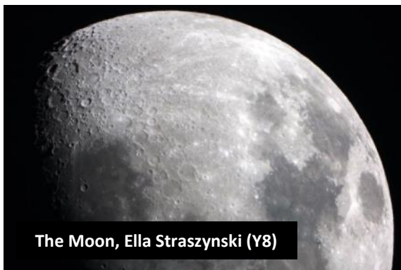
The Moon, Ella Straszynski (Y8)

Our Open Evening on Wednesday 12 th October was well attended and after skies cleared we again viewed the Space Station and Moon. Some visitors had downloaded the app and connected their phones to our wireless camera, allowing live views and video recordings. We also viewed Albireo, a beautiful double star, whose colours really shone out when we ramped up the saturation on our camera.