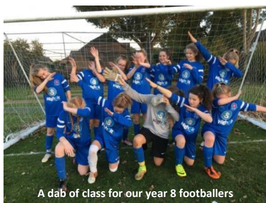
A dab of class for our year 8 footballers

At half time the girls had a good team chat. With the score being 0-0 and both teams