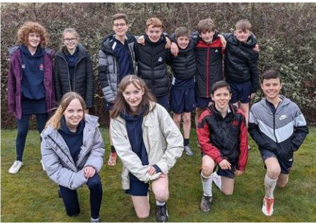
U13 cross country