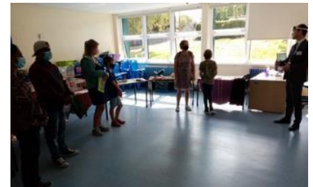
Our socially distanced open day

When we entered this term we knew it would not be long until we had to deal with our first cases of Covid-19 from the school community, but we made it to half term with just a single case. Since then, as winter arrived and rates climbed across the country, we were not surprised that cases in school also increased. The last couple of weeks have been most difficult, but even so in the last 10 days some year groups have had no cases at all. Others were affected more with a few across each year group but no clear pattern or clustering. Some staff were also affected. Close contacts have been asked to self-isolate each time and deep cleaning undertaken. Our Public Health England advisors tell us that community rates are high and, in such circumstances, it is almost impossible to prevent Covid entering school; a recent study called the Schools Infection Survey reflects this view.