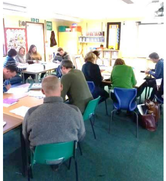
Sixth form tutors engaged in a session on 'British Values' on INSET day

The groups last met again on our INSET day last month where they reviewed their progress and are planning observations of each other's lessons this term.