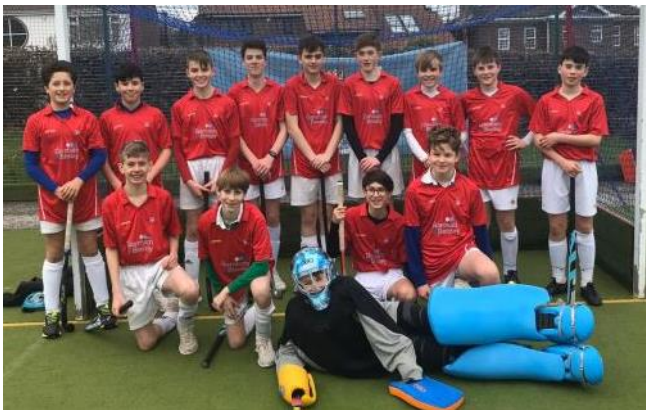
February 5 th : U14 boys' hockey tournament at Eastbourne College: lost three and drew one against some challenging private school opponents.