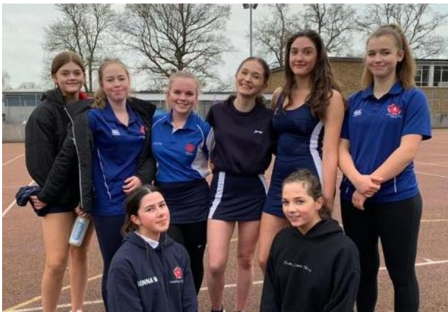
February 5 th : U16 netball end of season tournament : came second overall after a close final game against Millais.