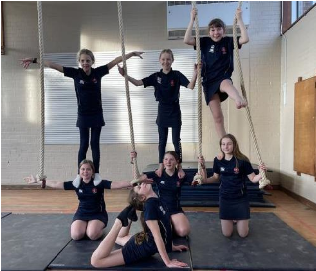
... whether indoors or out