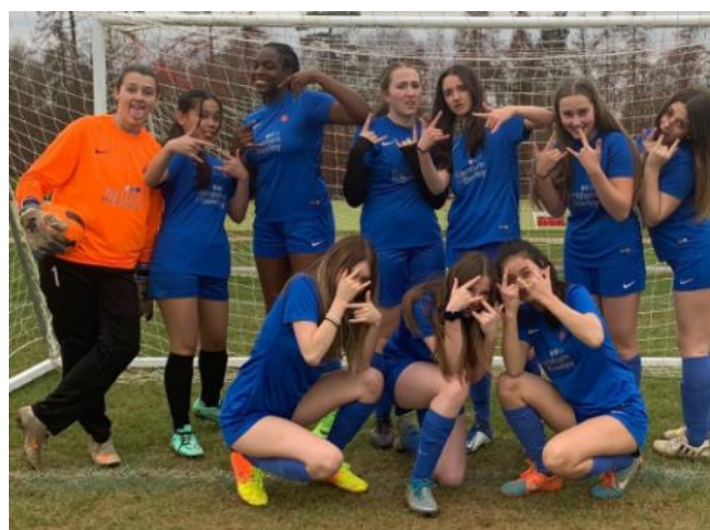
Our U15 girls' team. Counting how many goals they wish they'd scored ...