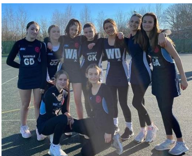
The year tens have been busy – this is our U15 netball team