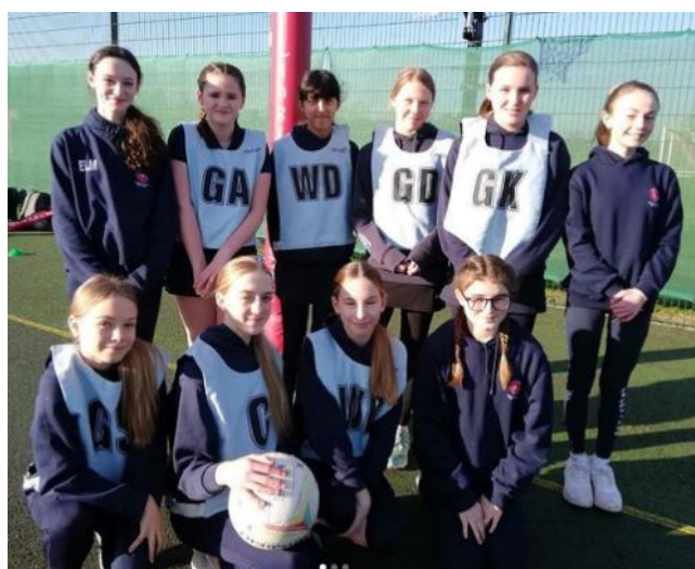
Our U13 netball team after the invitational Lingfield tournament