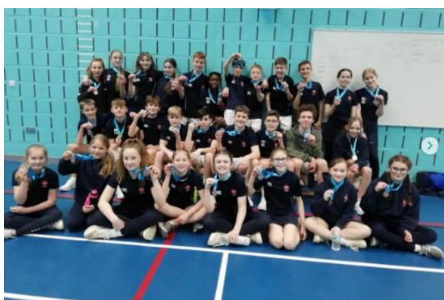
The U13 sports-hall athletics team – brought home a hatful of medals

One of the best things of our cautious emergence from two years dominated by the pandemic is the number of after school fixtures we are now able to play. A few of our favourite photos from this term are here.