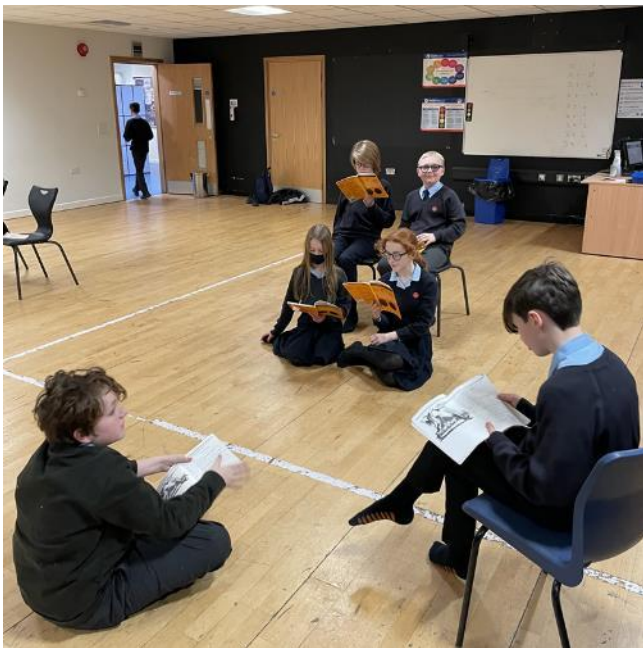
KS3 drama club