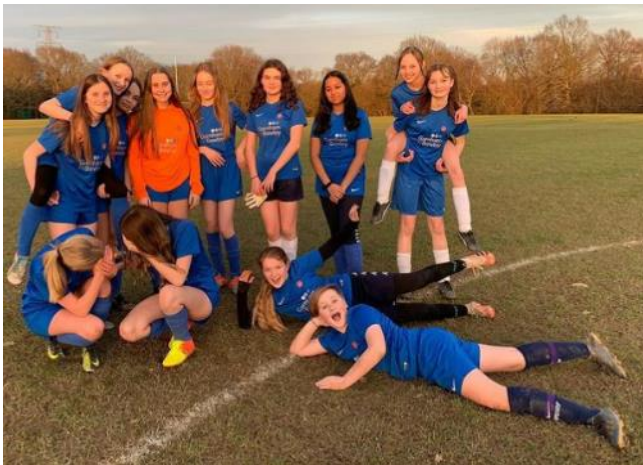
U14 girls after a narrow loss to Hazelwick