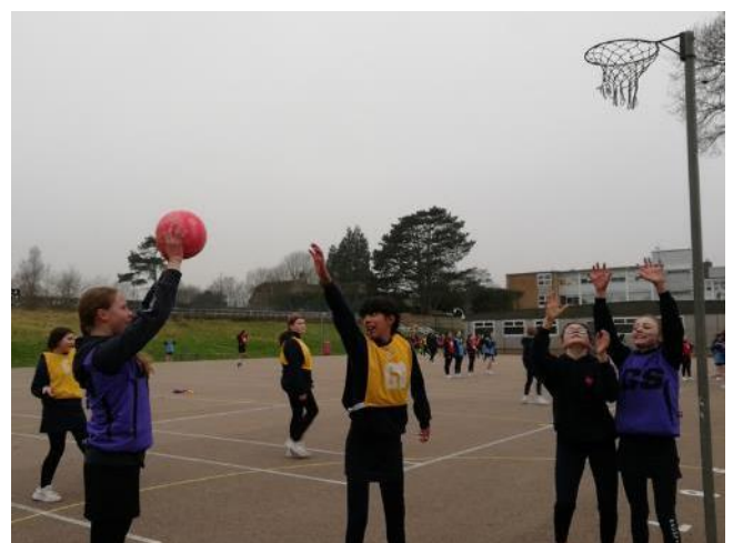
PE activities are always popular ...