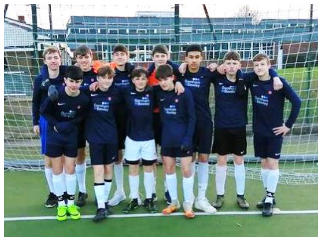
And their peers in the U15 football team