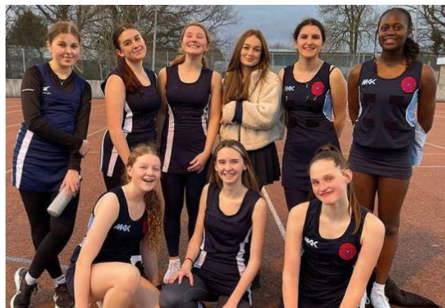
Our U16 netball team who came second in their end-of-season tournament