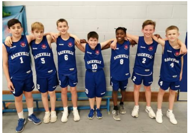
U12 basketballers smiling after winning the local derby against Imberhorne