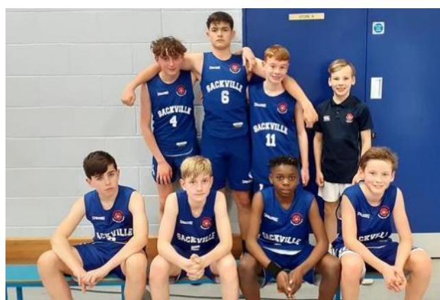
The U13 Basketball team after a narrow loss to Lingfield