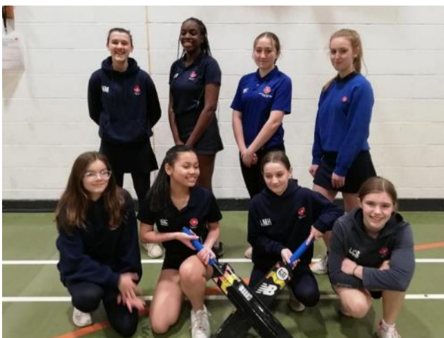
This is our U15 girls' indoor cricket team