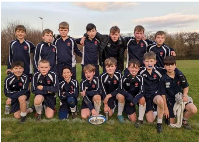
U12 rugby players happy to have played Oathall