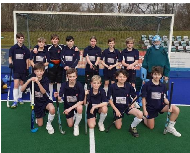
U13 mixed hockey