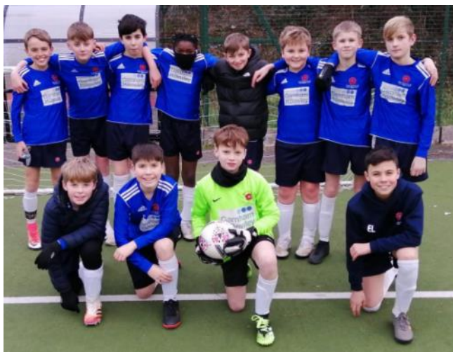
Our U12 boys' football team