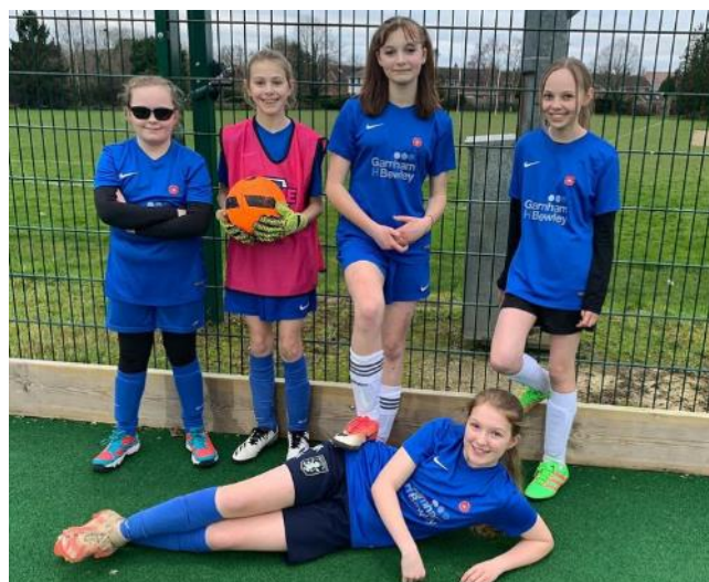
U13 girls' five-a-side team (well it should have been six ...)