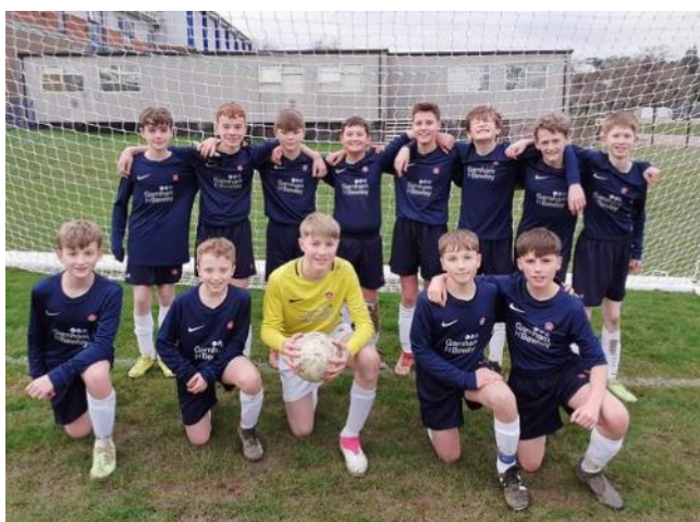
The U13 boys' football team full of smiles after a big win over Oxted