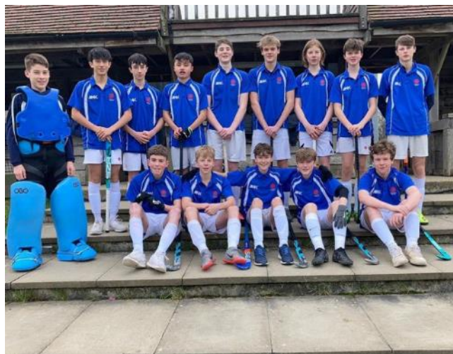
The undefeated U15 boys' hockey team