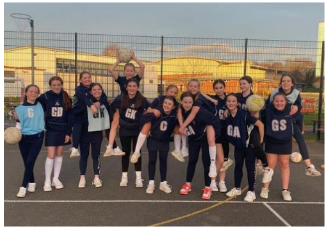
U12 netball A and B teams after beating Millais