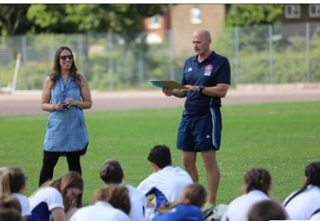
Year 9 sports day