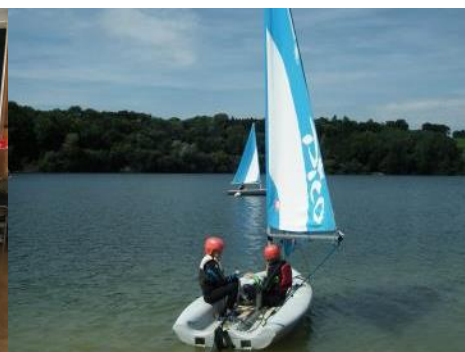
Year 7 at Ardingly