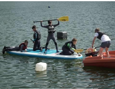
Year 7 Ardingly paddle-boarding