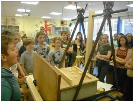
Year 8 STEM day – surviving disasters