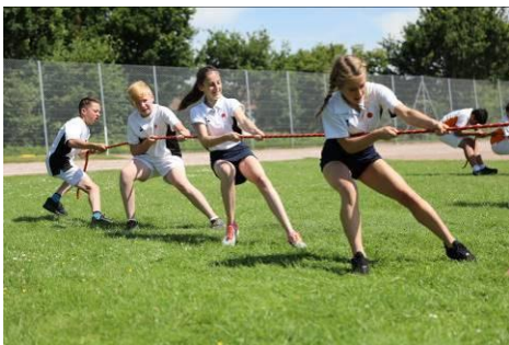
Year 7 sports day