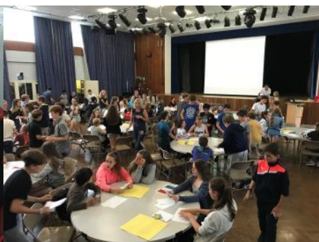
Year 7 SMSC Fair Trade game