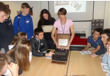
Year 10 visit Bletchley Park