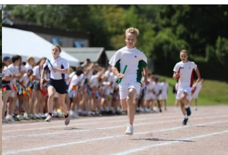
Year 8 sports day