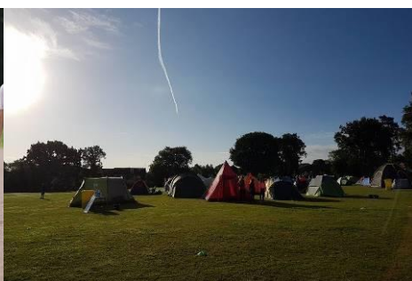
Year 7 camp with inflatable assault course