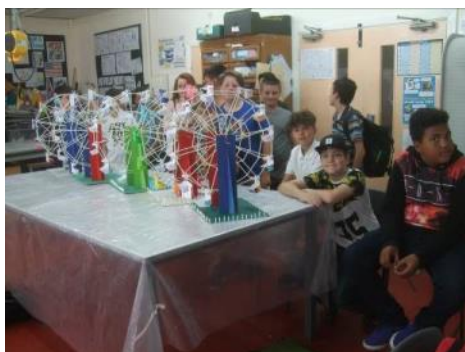
Year 7 Millenium Wheel (17 years late!)