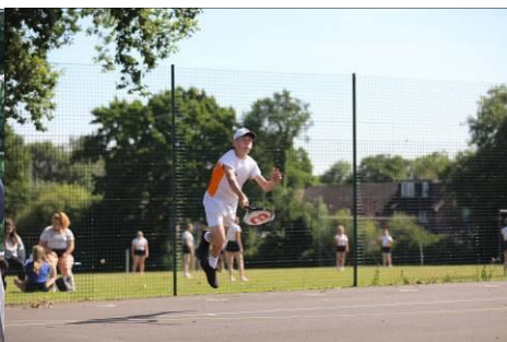
Year 9 sports day