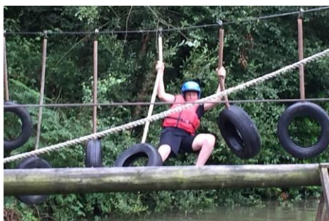
Year 9 at Team Dynamics