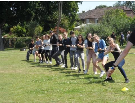
Year 10 put through their paces by the army