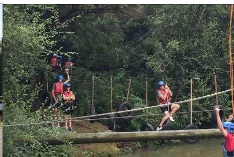
Year 9 at Team Dynamics