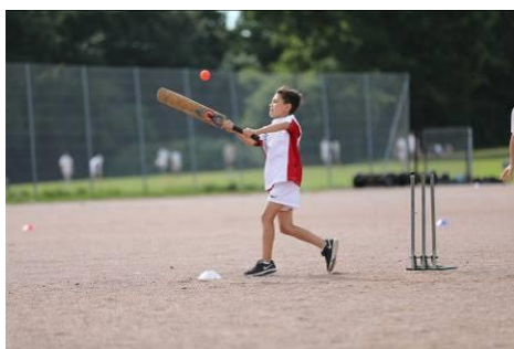
Year 8 sports day