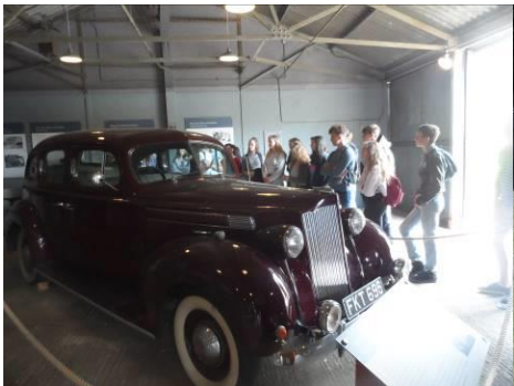
Year 10 visit Bletchley Park