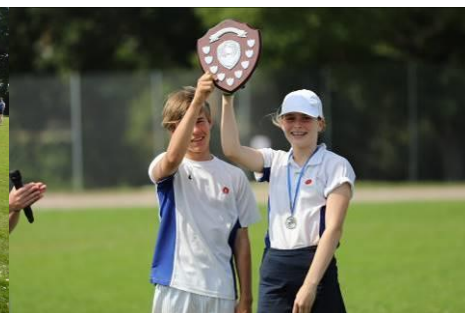
Year 9 sports day