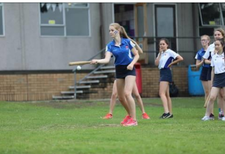
Year 10 sports day