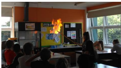
Year 7 STEM day