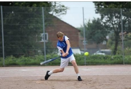
Year 10 sports day