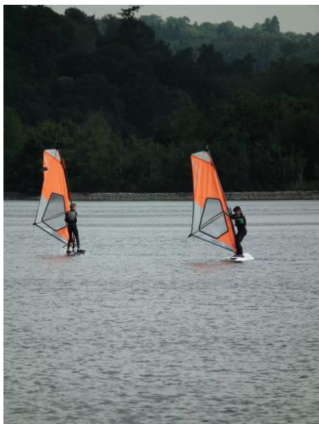
Year 7 at Ardingly