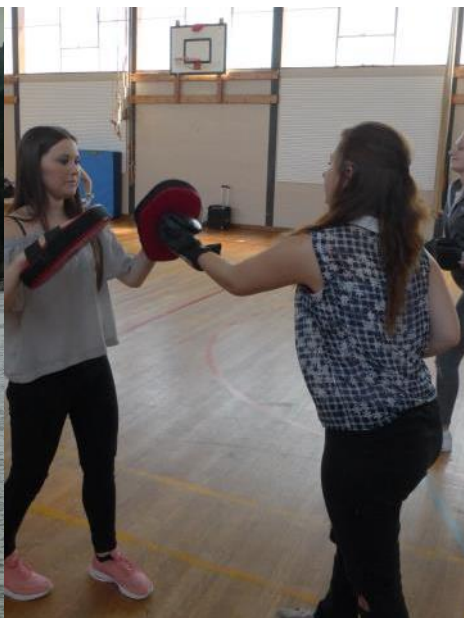
Year 10 fitness