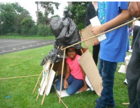
Year 8 STEM day – surviving disasters