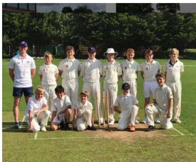
Sackville U12 A