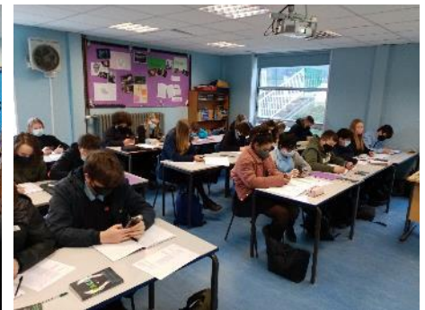
Year 9 English analysing poems