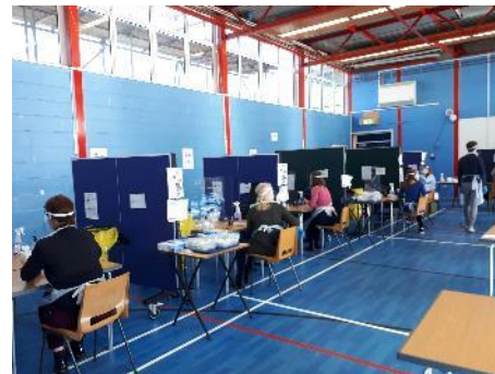
Our testers – they lived in the D block hall for over a week!

As you can see from the pictures, COVID testing played a large part in the week. We have tested every student with consent twice over the last six working days and have now issued home testing kits for students to last until the Easter holiday. We have completed over 2500 tests over the last six days, none of which has been positive. This supports the published figures of the low prevalence of the virus in this area at present. Mr Bush writes later in Sackville News with some guidance on the use of the home testing kits.