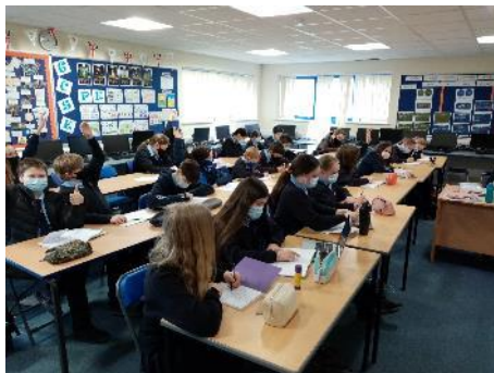
Year 7 science first thing on Wednesday morning