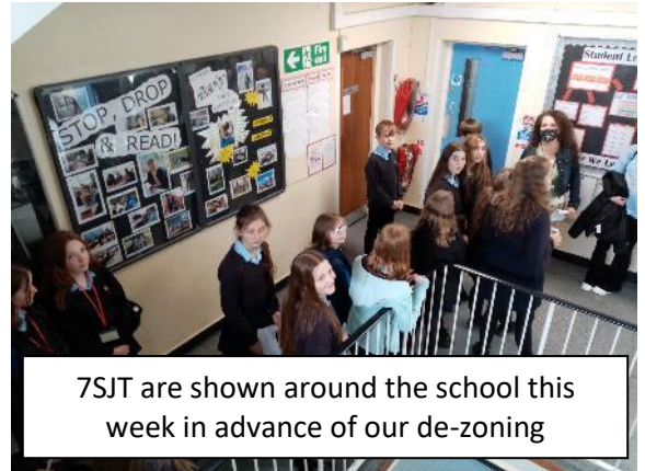
7SJT are shown around the school this week in advance of our de-zoning

We are really looking forward to this next step towards a more normal experience and hope the students are too.