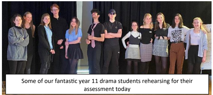
Some of our fantastic year 11 drama students rehearsing for their assessment today

With the end of assessments we have said a fond farewell to our year 13 students with a BBQ on Wednesday and also au revoir to our year 11s . Many year 11s will be returning to continue their studies in year 12, and a number will be invited back in for some transition sessions in the second half of the summer term. All subject areas will be setting transition work on their Google Classrooms so that our year 11s keep their excellent study habits over the summer.