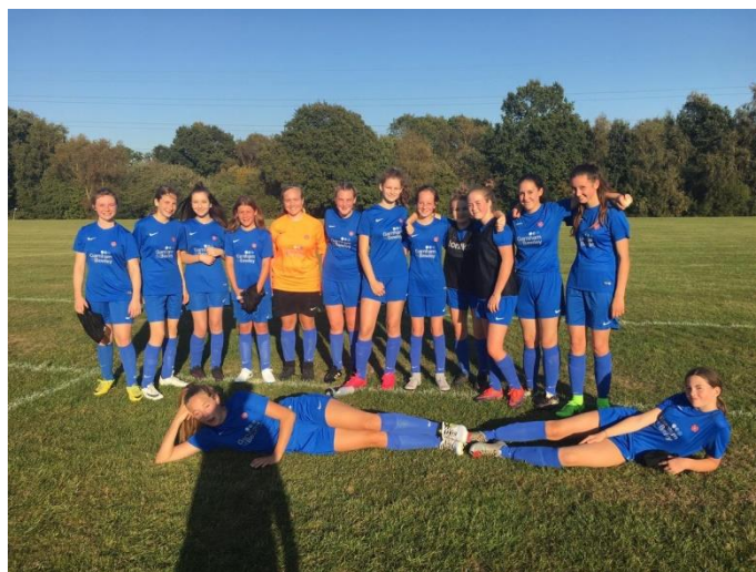
U14 girls' football (some a little laid back)