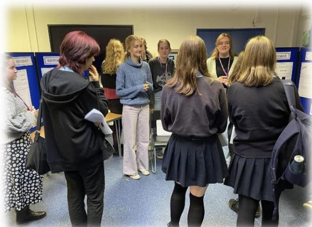
Year 13 students talking to Year 11 about the pathways into the sixth form