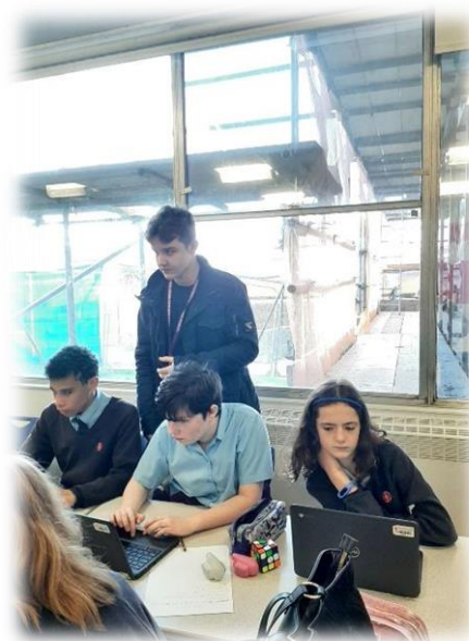
Year 13 student mentoring Year 8

As we approach the latter half of the autumn term, Year 13 students are busy preparing for their first set of mocks. At the same time, we are preparing for our Year 11 into 12 open evening on Tuesday 8 November and showing Year 11 students the exciting opportunities that exist in the Sixth Form here; both for study and personal development. We have sought to broaden our curriculum; this set of Year 12 students are the first to be offered Criminology, Child Development and a Maths in Context AS level qualification. They are also embarking on an exciting enrichment programme 'LIFE' which will give opportunities for volunteering, mentoring within the community and extension programmes of study, such as EPQ and online courses.