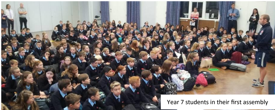
Year 7 students in their first assembly

Welcome back to everyone. I do hope you have had a good summer and we look forward to another fruitful year ahead. I would like to begin by thanking the many people who have worked so hard over the past six weeks in preparing the premises for our return; they have done a fine job!