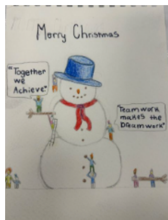
Highly Commended P Lock Year 8 Turing