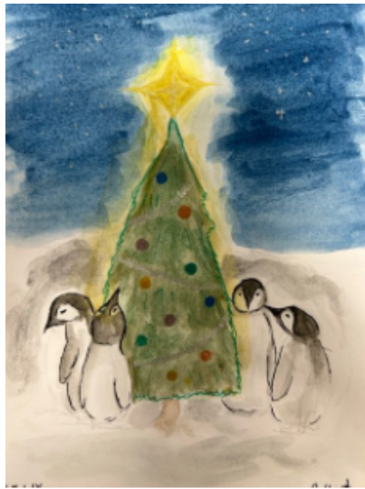
2nd Places L Rolland Year 8 Turing