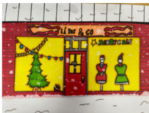
Highly Commended P Sands Year 8 Yousafzai